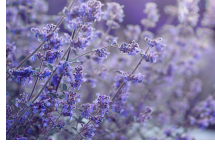
Daisies ( Leucanthemum spp.):