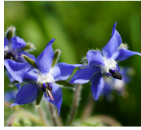
Catmint ( Nepeta spp.):