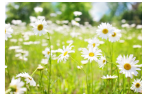
Thyme ( Thymus spp.):